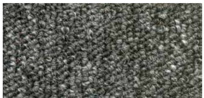
ST-09 Night Grey