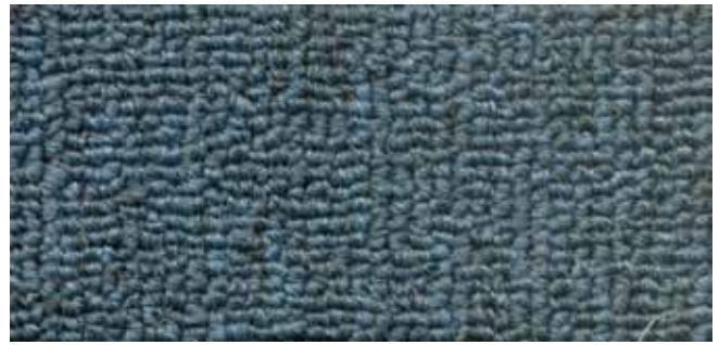
ST-88 Jewel Blue