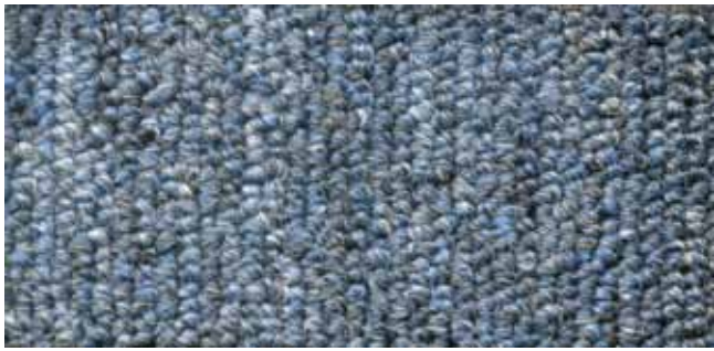
ST-12 Normal Blue