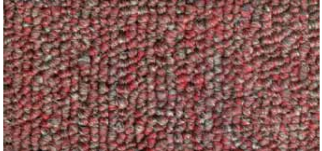
ST-14 Grey Red