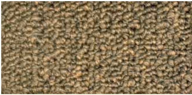
ST-22 Yellow Brown