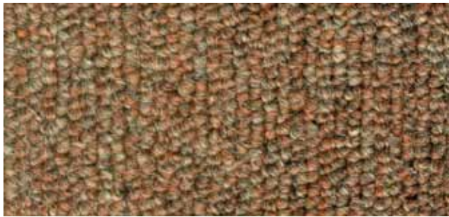
ST-68 Red Brown