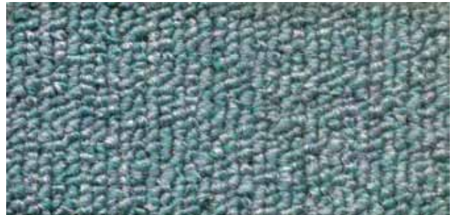
ST-13 Diamond Green