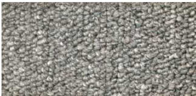
ST-04 Normal Grey