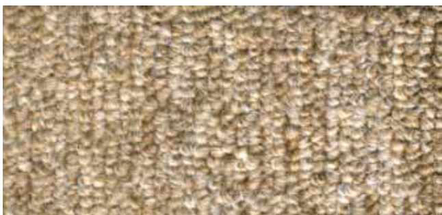
ST-78 Light Brown