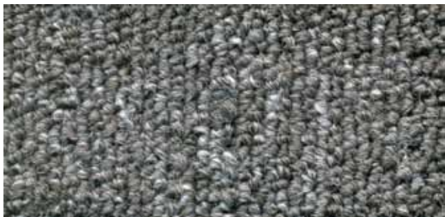
ST-06 Dark Grey