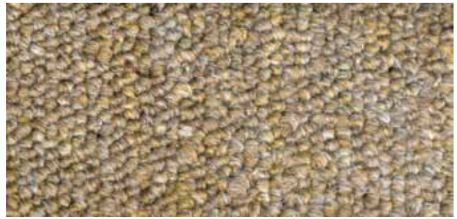
ST-31 Coffee Brown