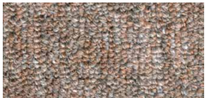
ST-28 Grey Brown