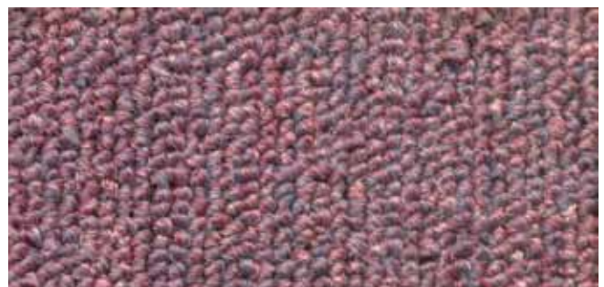
ST-30 Grape Purple