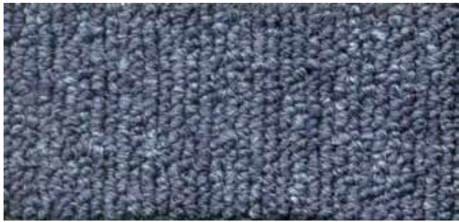
ST-29 Dark Blue