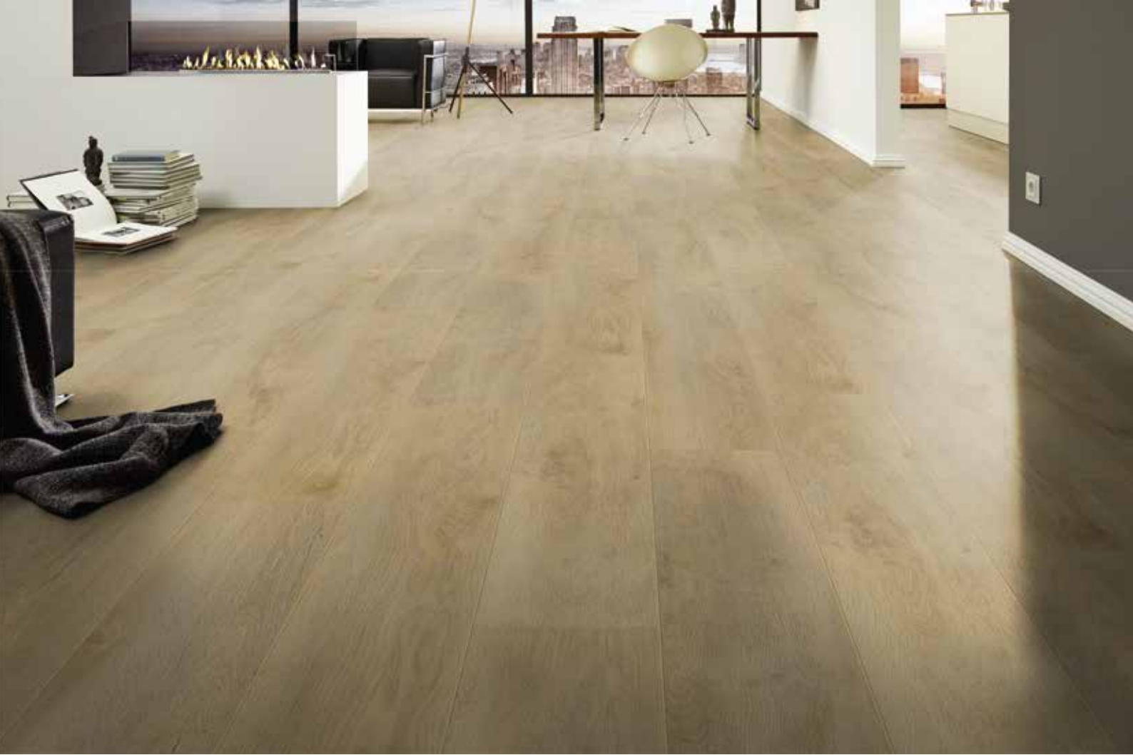
Premium Oak Nature - D 4955 AF