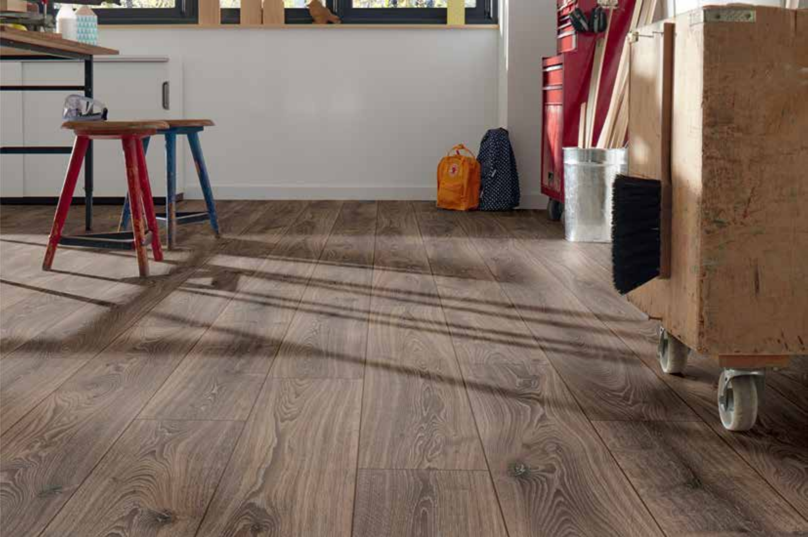
Timeless Oak - D 3590 ER