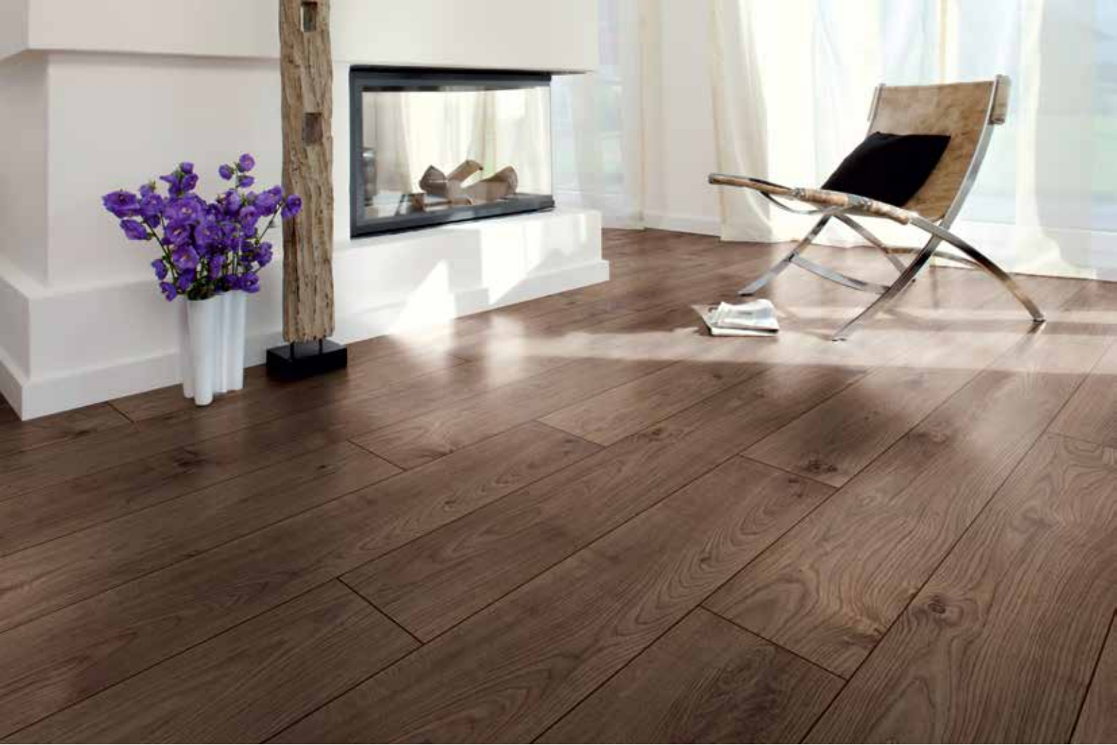
Atlas Oak Coffee - D 3591 ER