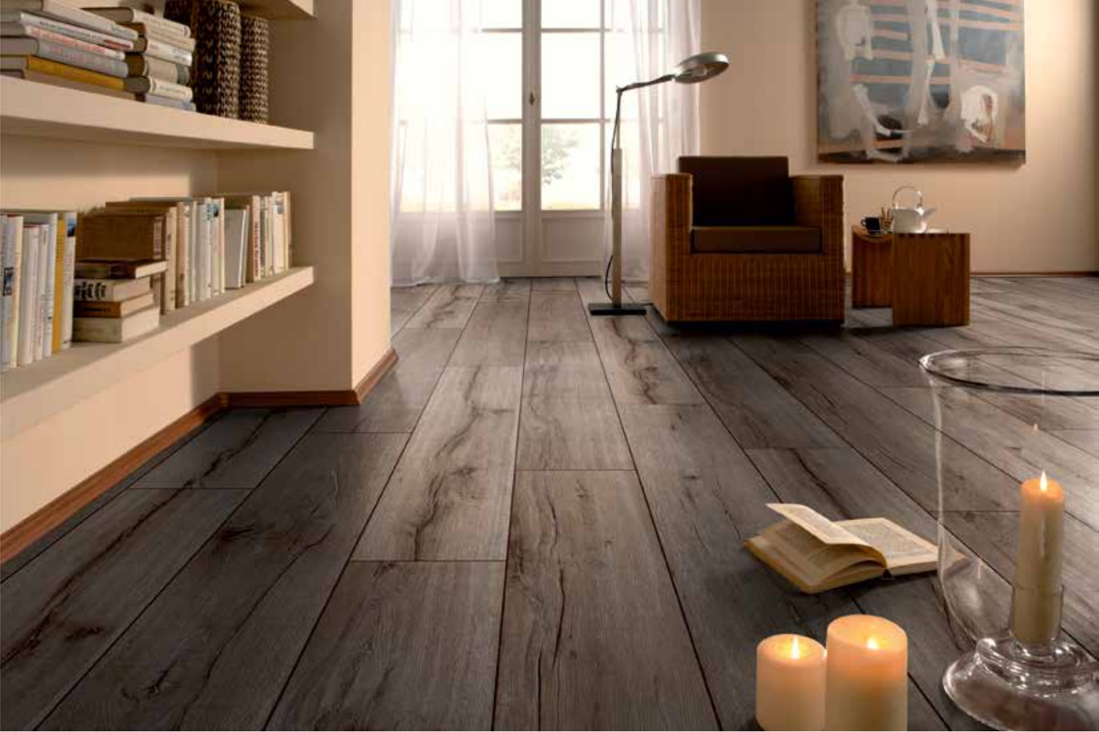
Rip Oak - D 3075 MX