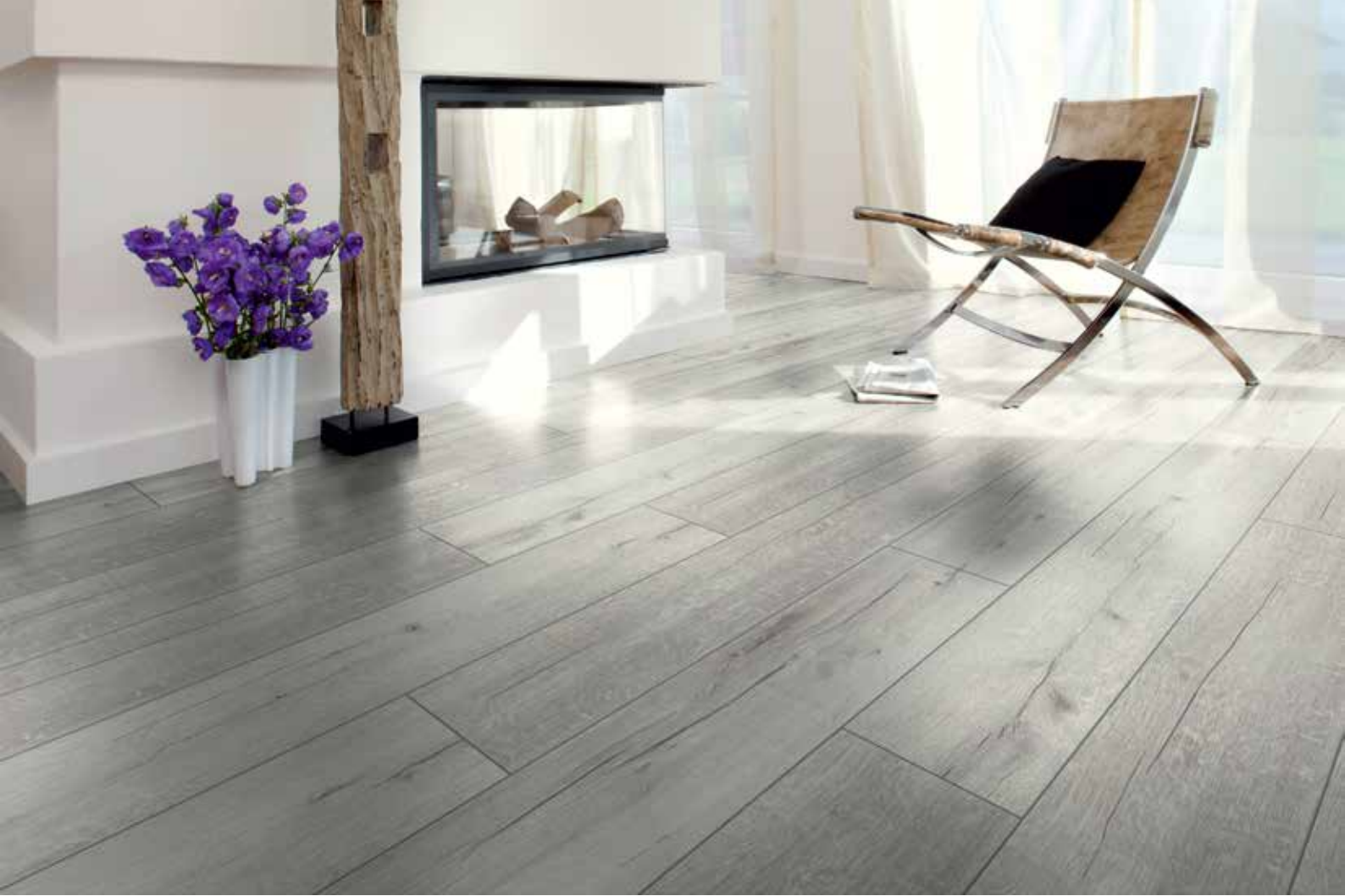
Rip Oak White - D 3181 MX