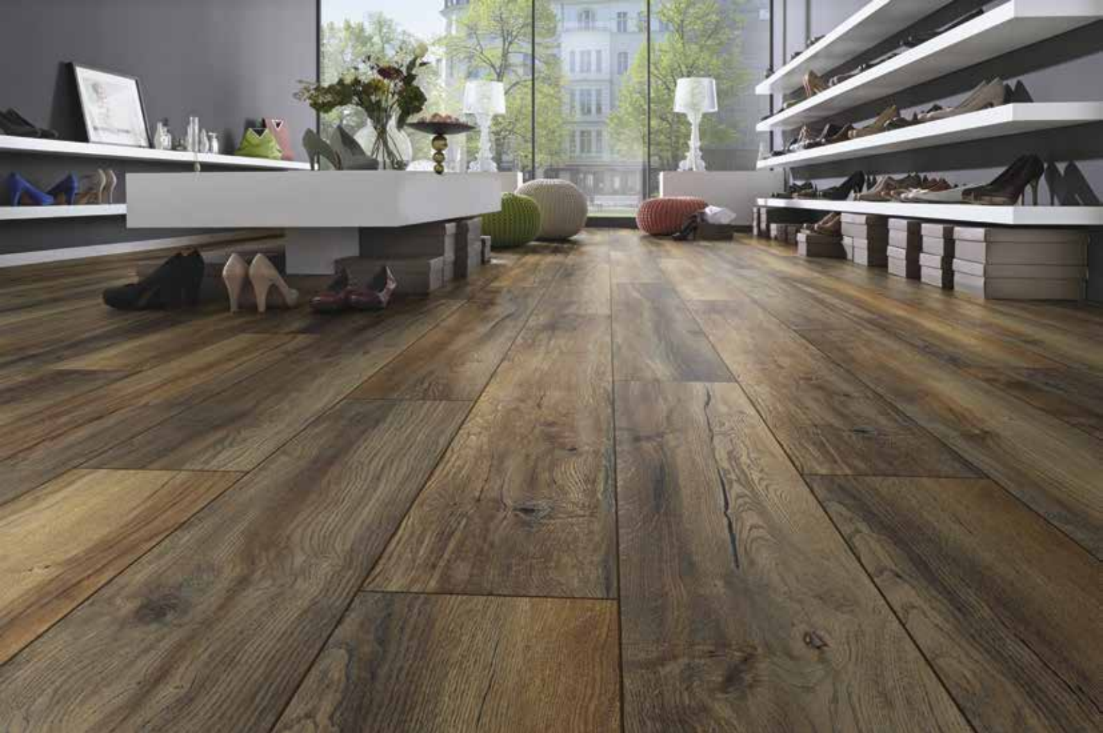
Harbour Oak - D 3570 ER